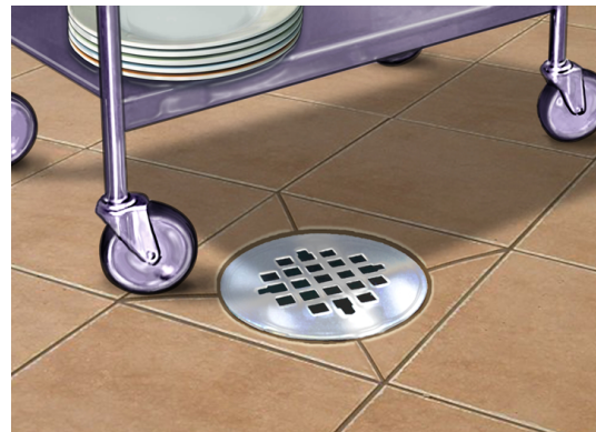
Sanitary Sewer Drain: An indoor drain that flows to the Sewage Treatment Plant.