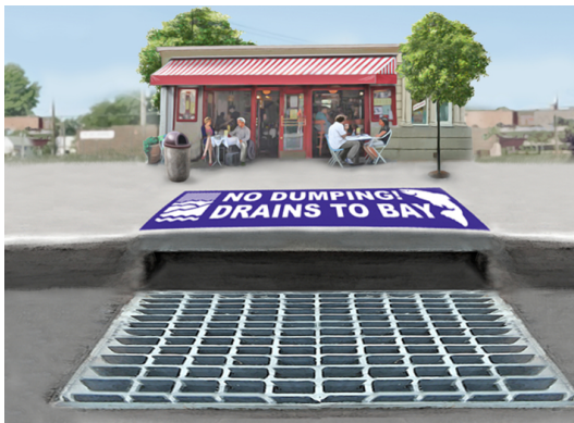
Storm Drain: An outdoor drain that flows directly to creeks and the Bay.

If you are not certain whether a drain leads to the storm drain or sanitary sewer, call your local stormwater agency for assistance.