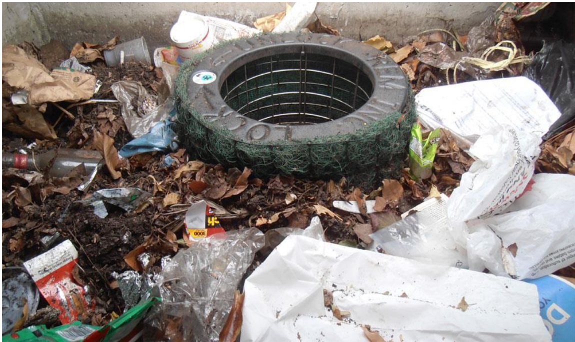
Trash capture device in a catch basin.