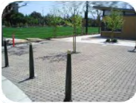
Permeable Interlocking Concrete Pavers

Bay Area Stormwater Management Agencies Association