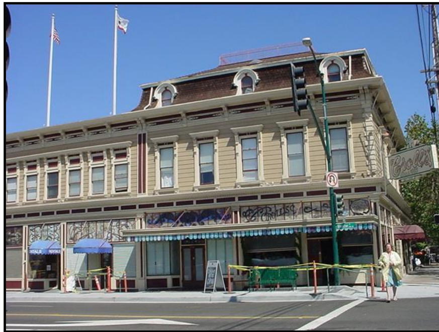
Webster Street, Croll's Tavern

A Strategic Plan Committee appointed by the City Council in 1988 gave Alameda a "C" for retail shopping, and conducted a survey of issues that identified "improved shopping/more convenient shopping" as a major need and opportunity. A question is how much more business can be attracted to Alameda, which is out of the way for nonresidents and does not have a large enough population to support large department stores or high-volume discounters. Three sources of increased sales will be: new residents, nonresidents attracted to restaurants and boating-related businesses, and the rising per capita disposable income of existing residents. Improved merchandising can capture sales made to Alamedans at off-Island locations.