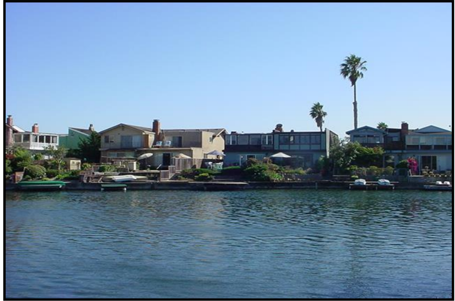
Homes on a lagoon