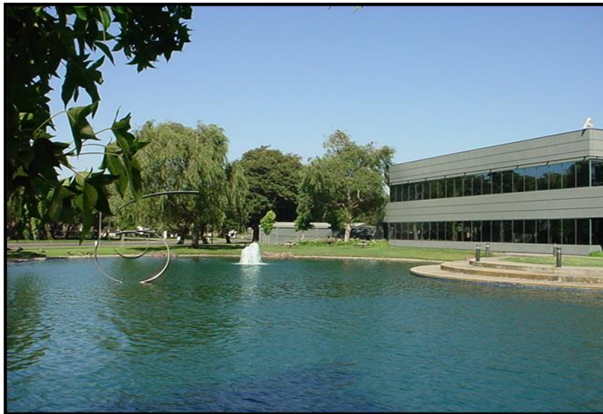
Harbor Bay Business Park