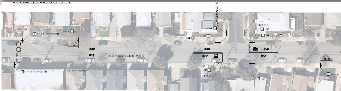
VERSAILLES AVE & OTIS DR