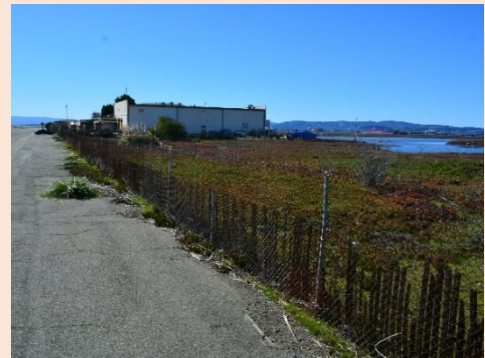
This former naval base is being remediated and provides opportunity to expand the existing wetlands.